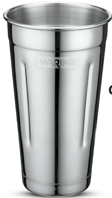
CAC20 Stainless Steel Malt Cup