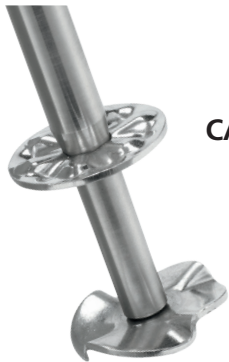
CAC112 Solid Agitator (6 pack)