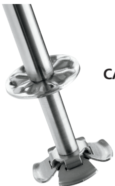
CAC123 Butterfly Agitator (6 pack)