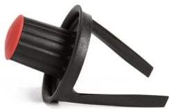
PATENTED TWISTER LID