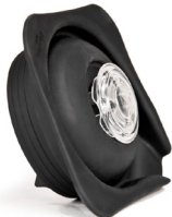
MINI GRIPPER LID