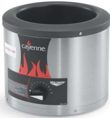
Cayenne® Model SS-4 Warmer