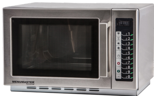
Model MCS10TS shown