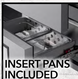
INSERT PANS INCLUDED