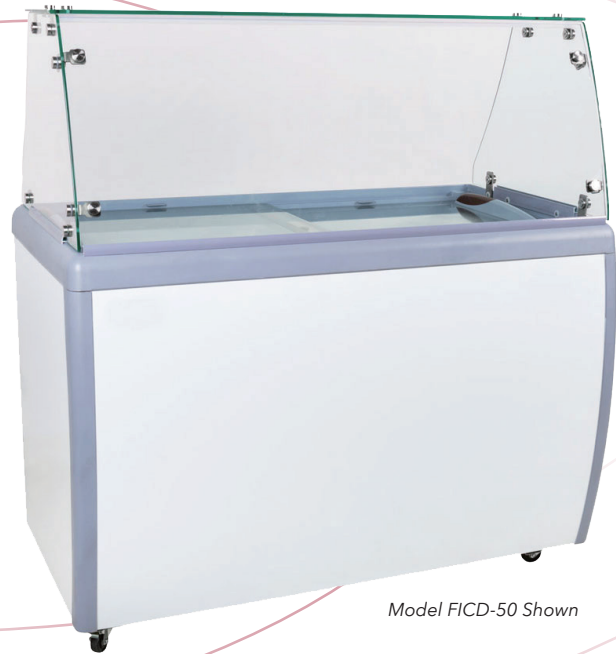
Model FICD-50 Shown