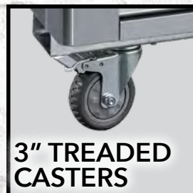
3" TREADED CASTERS