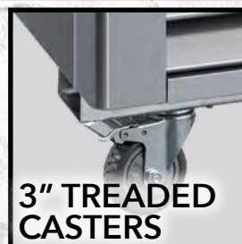
3" TREADED CASTERS