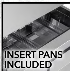
INSERT PANS INCLUDED