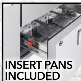
INSERT PANS INCLUDED