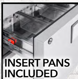
INSERT PANS INCLUDED