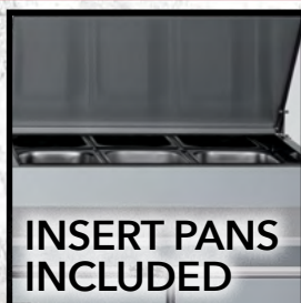
INSERT PANS INCLUDED