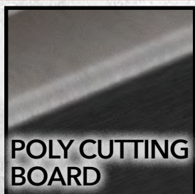
POLY CUTTING BOARD