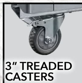
3" TREADED CASTERS