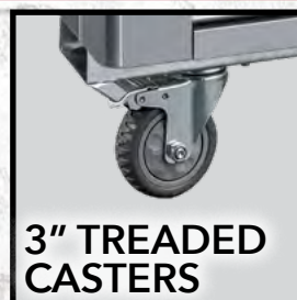
3" TREADED CASTERS