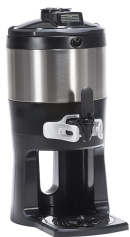
TF SERVER, 1G DSG GEN3