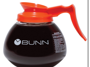
DECANTER, GLASS-ORN 12 CUP 1PK