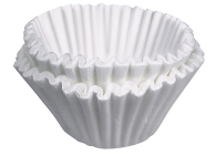
FILTERS, REGULAR 1M 500/2 50/CL