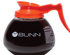
DECANTER, GLASS-ORN 12C 24/CS