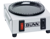
STOVE, WX1 120V/100W