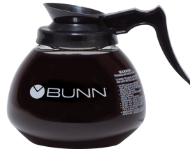
DECANTER, GLASS-BLK 12C 3/CS